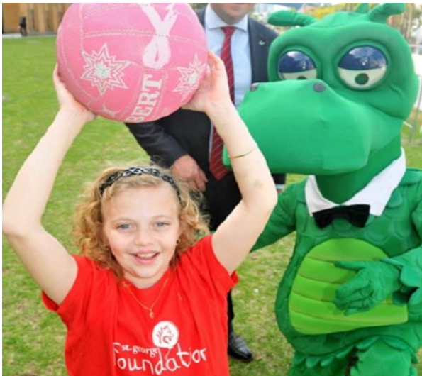
Transplant Australia Kids & Tackers Program

Our members share a special bond, having all been touched in some way by transplantation. They include those awaiting transplantation, donor families, living donors, transplant recipients, and the doctors, nurses and coordinators working in the organ and tissue donation and transplantation sector. While they have their own unique story to tell, they are part of a team that serves to celebrate and cherish the greatest gift of all – life itself.